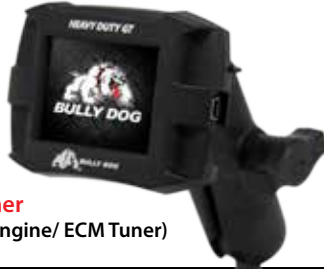
Heavy Duty Gauge Tuner (Heavy Duty Semi Truck Engine/ ECM Tuner)